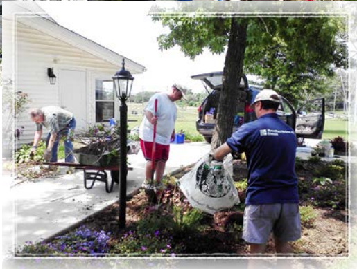
Gardening photos courtesy of Christine Brill