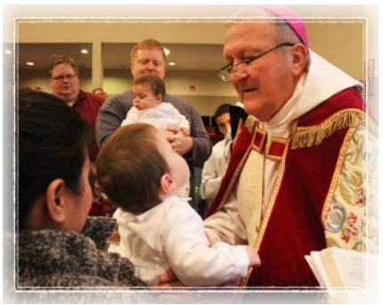
These twins couldn't keep their eyes off of the Bishop during their baptism last Sunday!