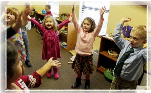
Above, children praise God in song.

A s our "young saints" return to their Godly Play lessons on the Communion of the Saints today, we thought it would be fun to take a look back at where they've been this fall and winter.