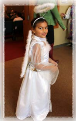
Our littlest angel, the star of Bethlehem.