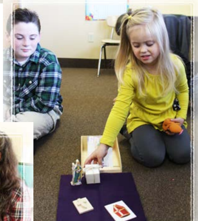
At left, children work with materials from the Godly Play lesson on St. Nicholas. Below, two children with their artwork on St. Andrew and St. Francis of Assisi.