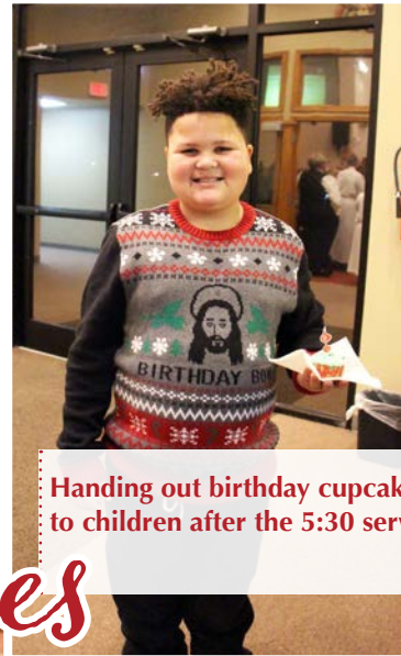
Handing out birthday cupcakes for Jesus to children after the 5:30 service.