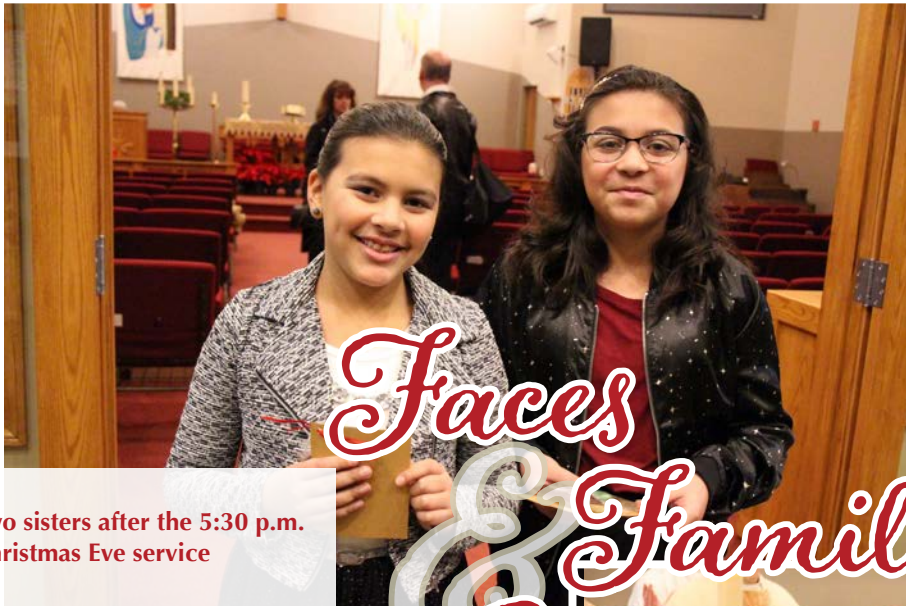
Two sisters after the 5:30 p.m. Christmas Eve service